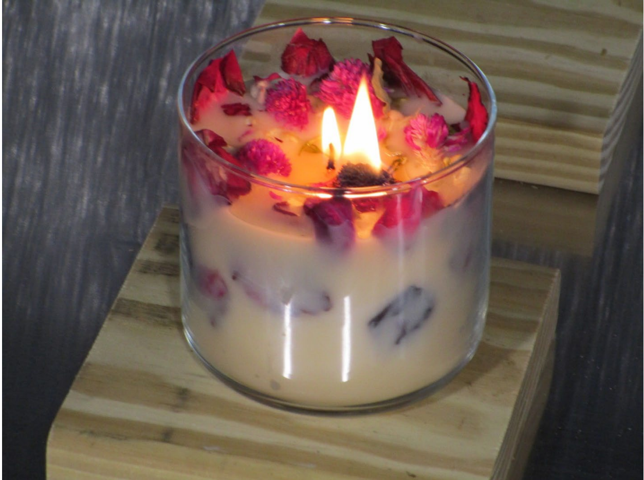
Figure 7: Candle-Lite Company candle, with secondary ignition of botanicals, during first four-hour burn cycle.