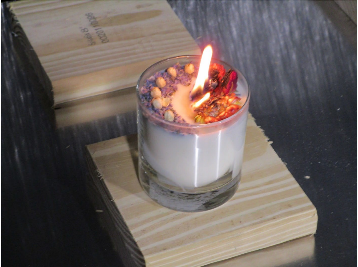
Figure 4: Renegade Candle Company candle shortly after lighting. Dried flower has ignited and is supporting combustion.