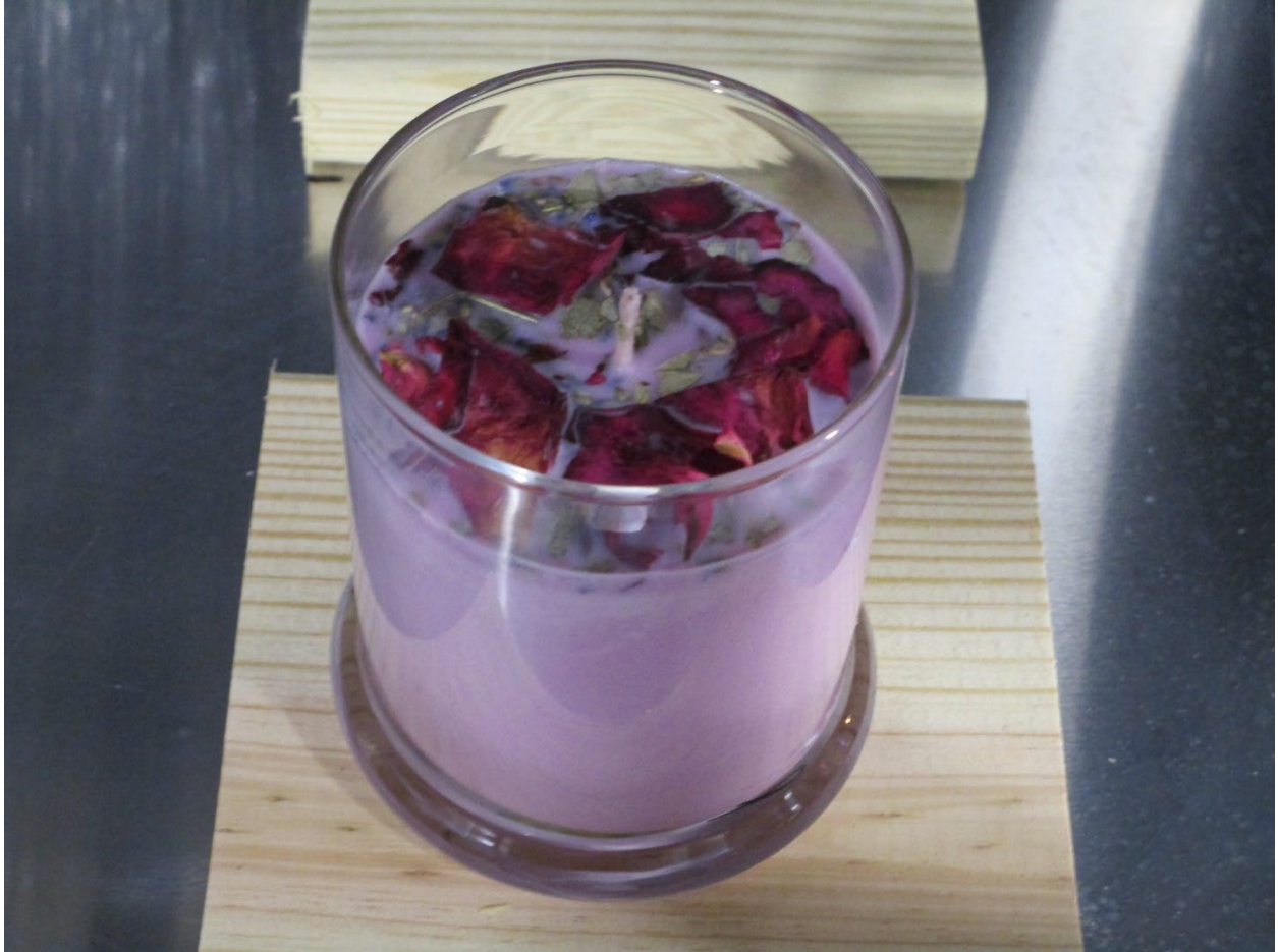
Figure 2: Photograph of candle supplied by Root Candle Company for testing.