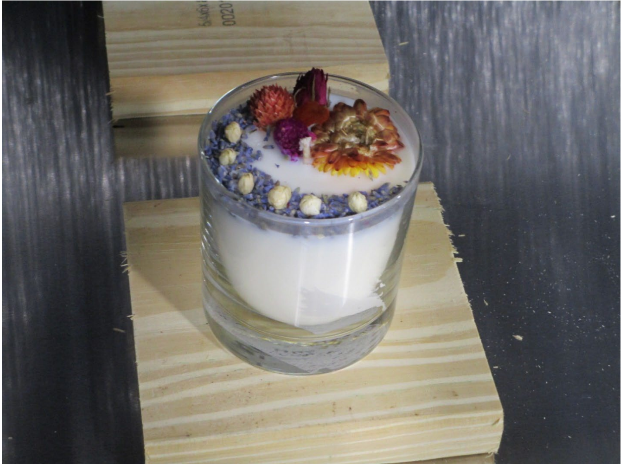
Figure 1: Photograph of candle supplied by Renegade Candle Company for testing.