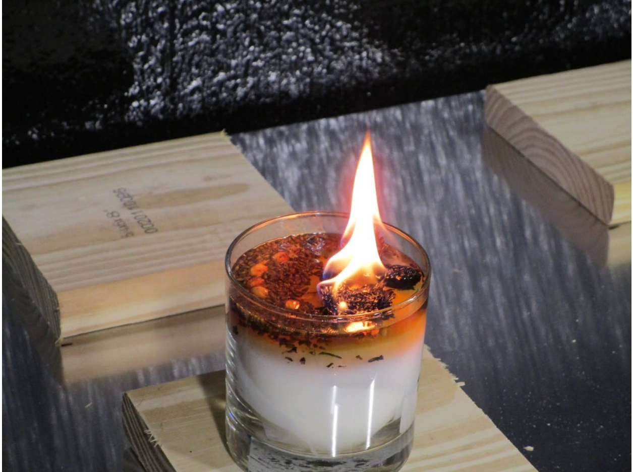
Figure 5: Renegade Candle Company candle with secondary ignition progressing. Wax pool is becoming deep.