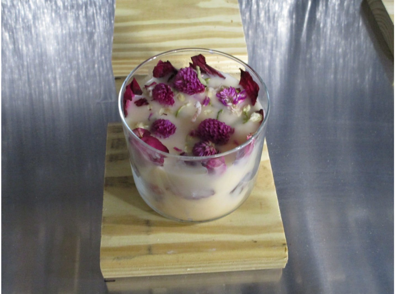
Figure 3: Photograph of candle supplied by Candle-Lite Company for testing.