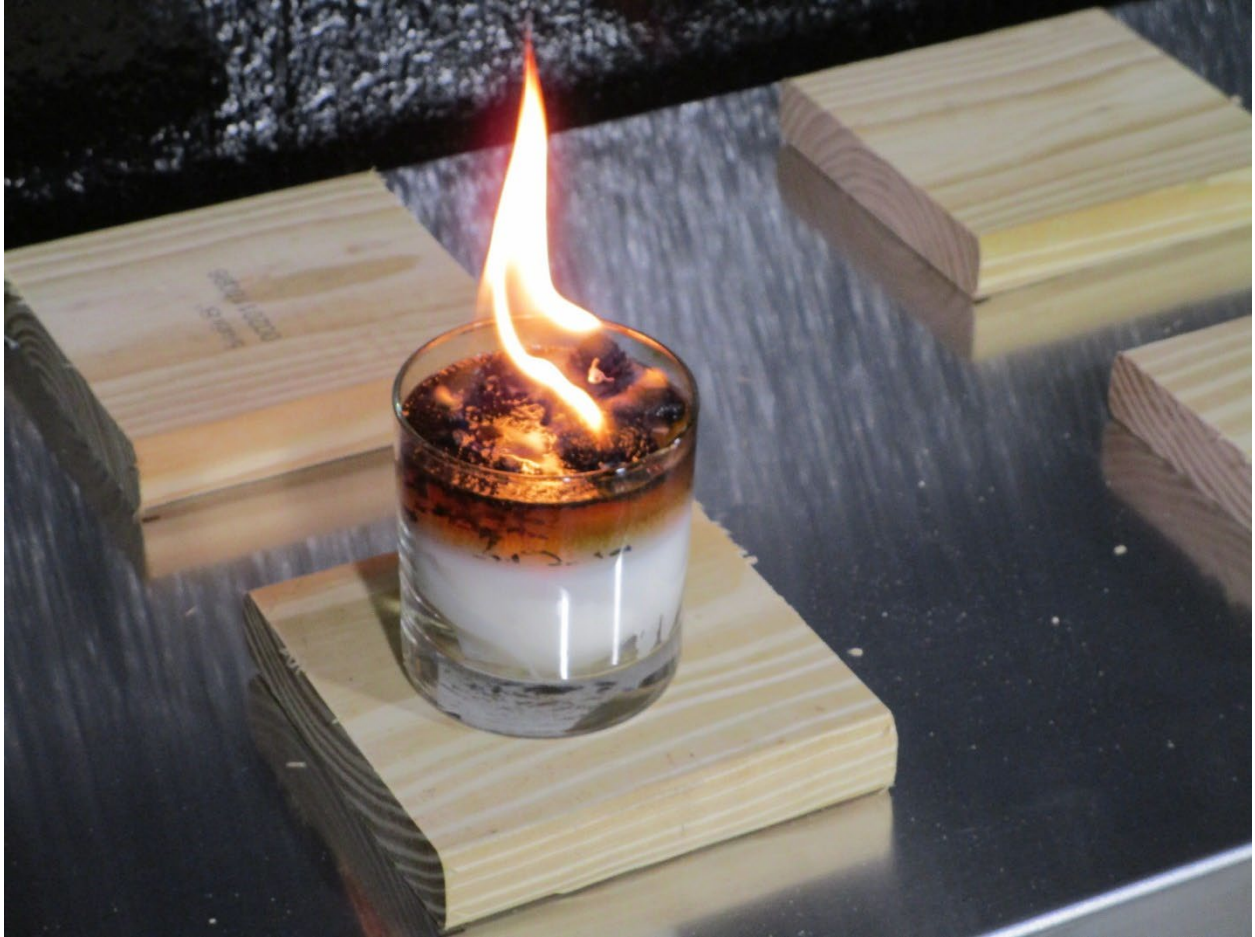
Figure 6: Renegade Candle Company candle. Within 50 minutes of lighting, candle experienced flashover where entire surface is on fire.