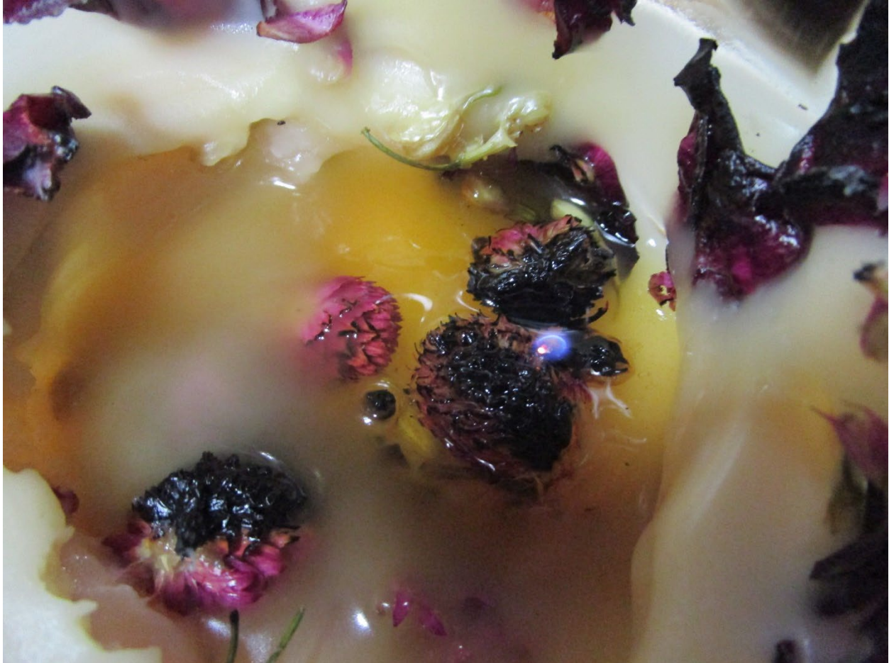
Figure 8: Thirty minutes after lighting Candle-Lite Company candle last time. Only botanicals remain lit and wax pool drowns out flame on wick.